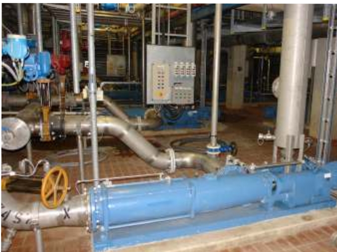
Feed pumps of the AE series for the filter beds

CIRCOR offers stators made of “Alldur®” in progressing cavity pumps manufactured by Allweiler® in Bottrop, Germany. These pumps have been used for decades in a variety of applications, including many sewage plants in Germany and other countries.