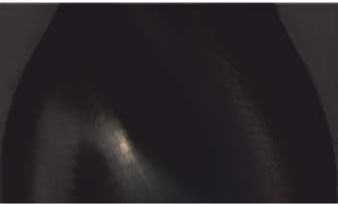
„Shark skin“ surface structure of the new „Alldur®“ stators