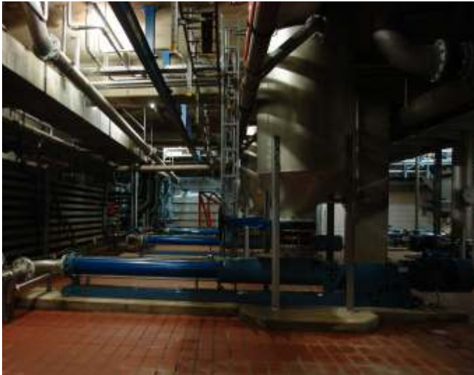
Discharge pumps of the AE series pump 5-10 m 3 /h of abrasive thick sludge at pressures of 8-12 bar.

another with "Alldur" – were tested while pumping thick sludge from a thickening machine.