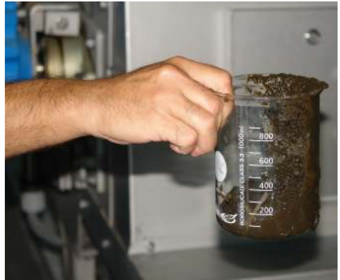
The pump moves 5 to 10 m 3 /h of abrasive thick sludge with 6% dry substance at a pressure of 8 to 12 bar.

They are characterized by their ability to easily pump liquids with a large proportion of dry substance and abrasive components. A variety of available designs and materials enable adaptation of the pumps to specific liquids and pumping conditions. Now, with stators made of “Alldur®”, they are even more economical.