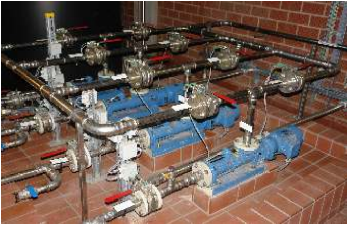
Allweiler® progressing cavity pumps of the AEB series dose the flocculant aids.