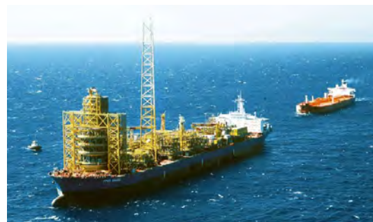
„FPSO BRASIL“ with ALLWEILER engineered solutions