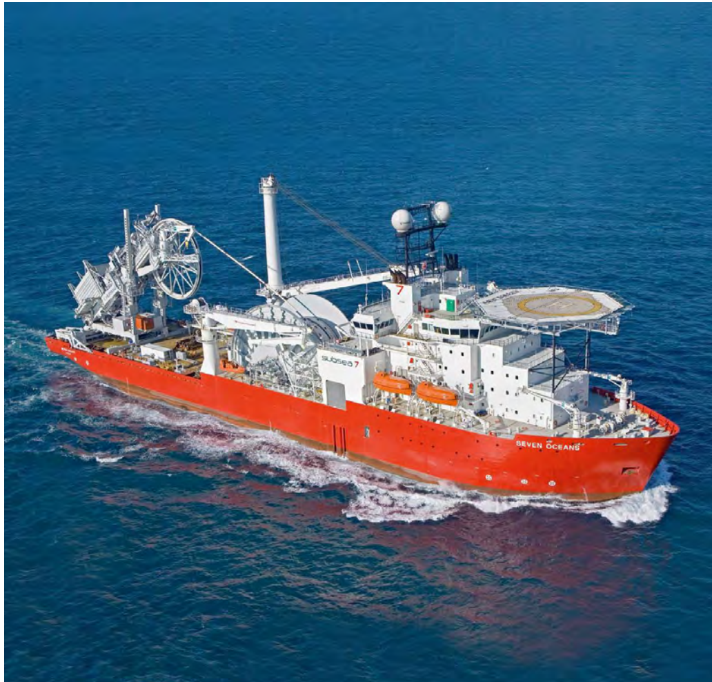
IHC MERWEDE Shipyard, Reeled Rigid Pipe-Laying – Offshore Construction Vessel „SEVEN OCEANS“ equipped with ALLWEILER Solutions.

150 years of experience ensures extreme reliability even under harshest environmental conditions and under the most stringent regulatory regimes.