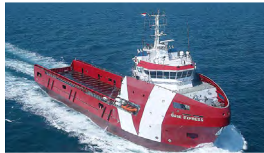
DAMEN Shipyards, Platform Supply Vessel „BASE EXPRESS“ equipped with ALLWEILER pumps